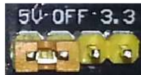
5 volt configuration

The left and right voltage output can be configured independently. To select the output voltage, move jumper to the corresponding pins. Note: power indicator LED and the breadboard power rails will not power on if both jumpers are in the “OFF” position.