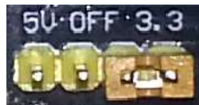
3.3 volt configuration